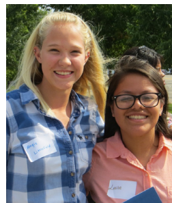
"I Am Me" theme created by Junior Leaders at Northeast High School